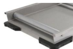
Robust corner bumpers