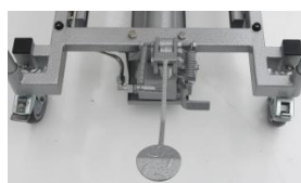
Foot pedal and lowering lever