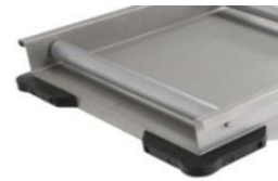
Robust corner bumpers