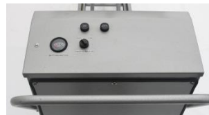
Height adjustment by electro-hydraulic module